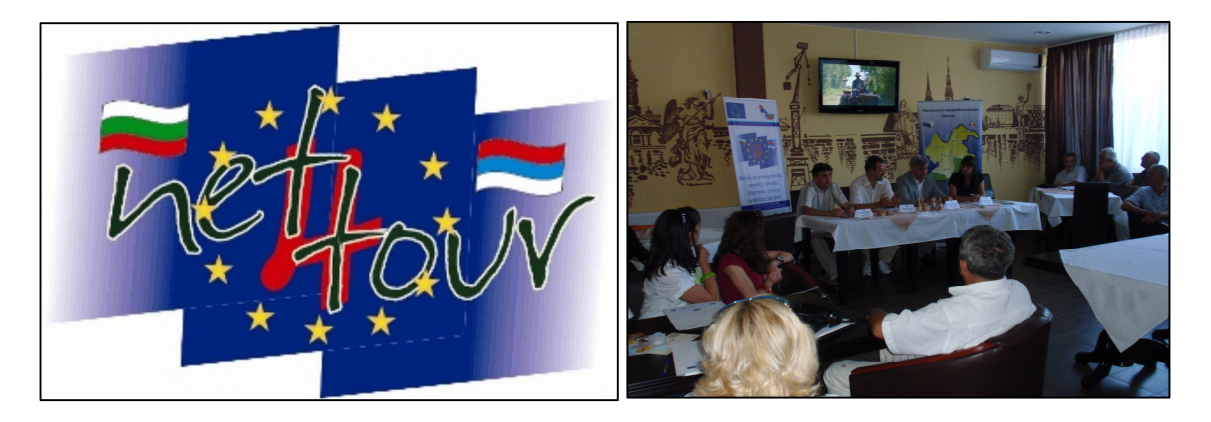
Project logo (left) and a photo from a project event (right)

Bulgaria-Serbia IPA Cross-Border Programme CCI Number 2007CB16IPO006