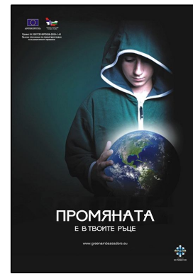
Project posters used in the promotional campaign