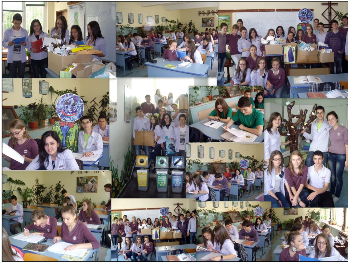
Photos from the awareness raising campaign