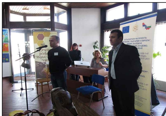
Photos from the project events