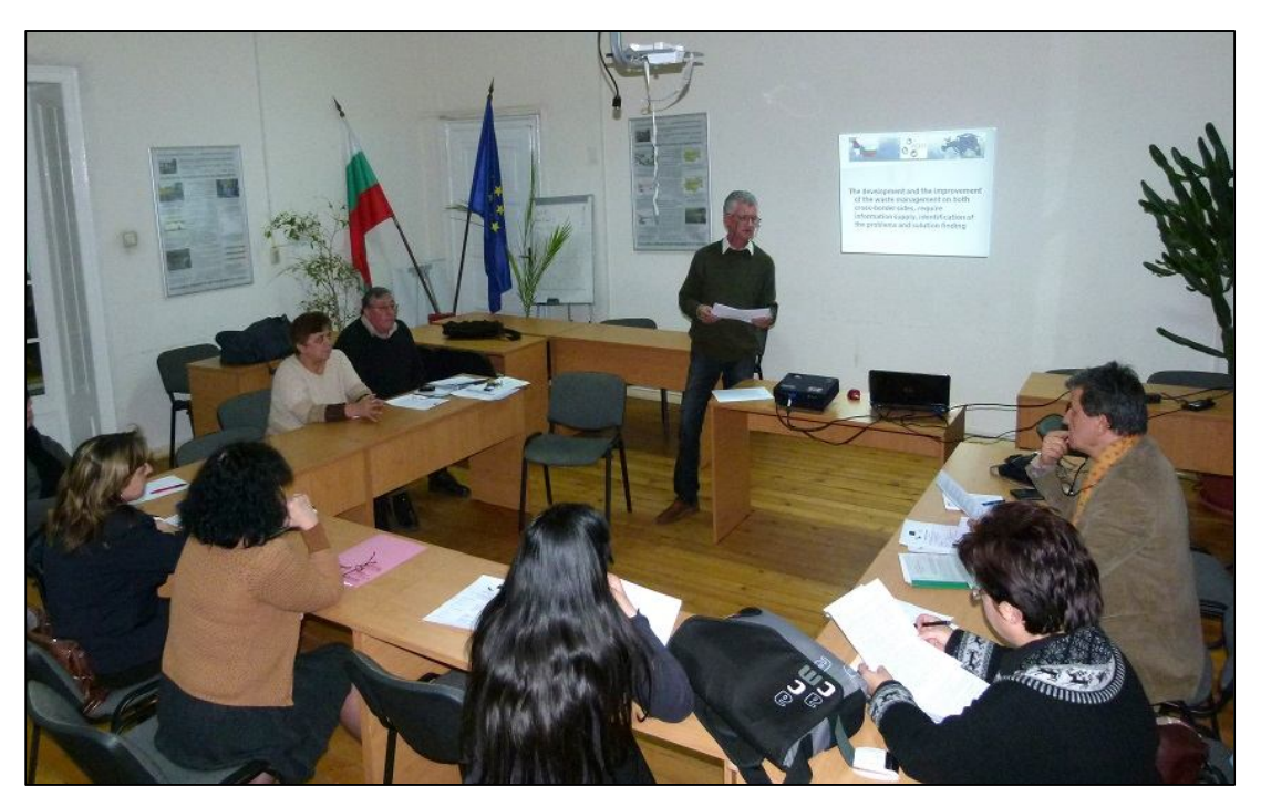
A detail from one of the project events