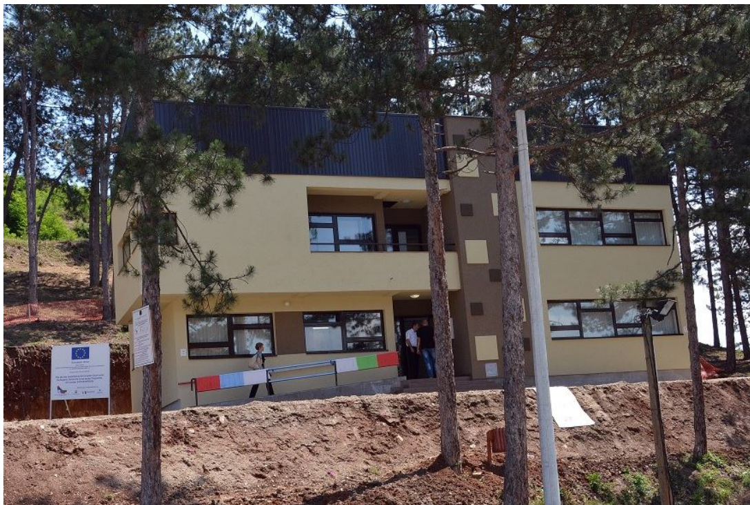
The newly constructed joint training centre CONNECTION

The project was successfully completed in June 2013.