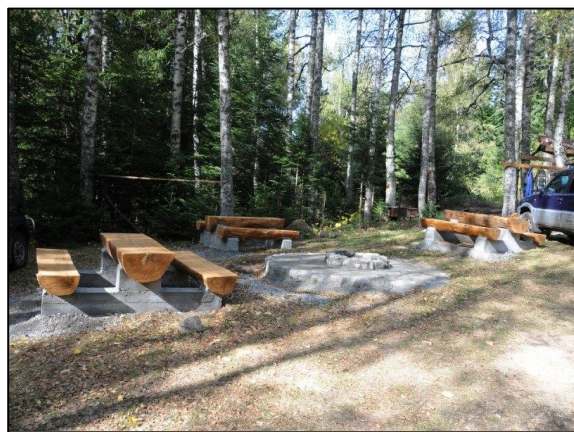
Details from the eco-path including resting places, information boards and even a bridge