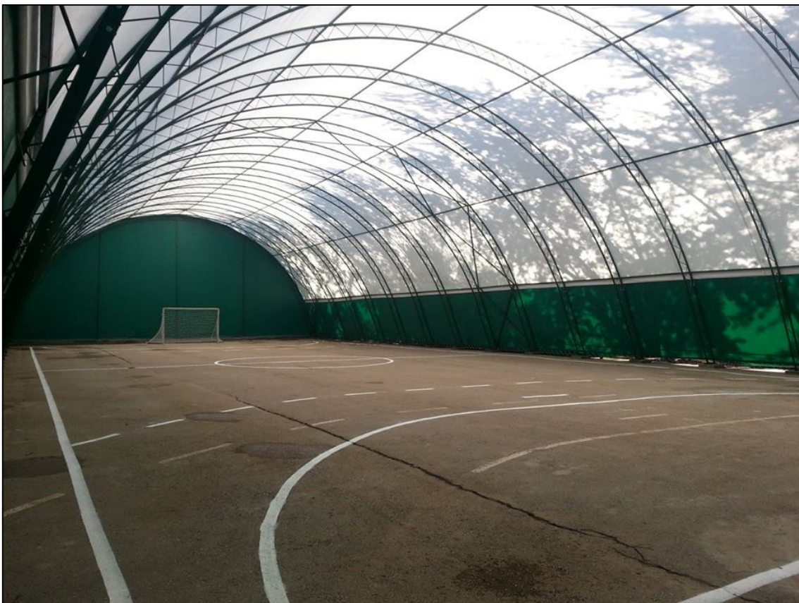
The newly constructed sports dome in Pantelej, Nis