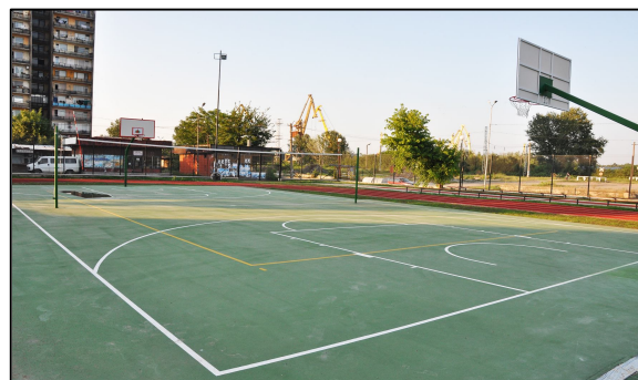
Playground in Lom before (upper left) and after the reconstruction