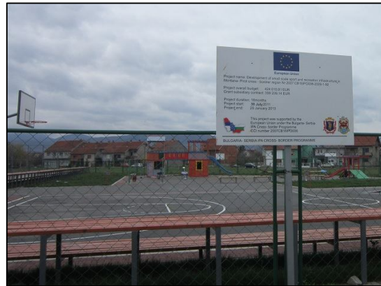
The outdoor facilities include playgrounds for small children and playing courts for basketball and football