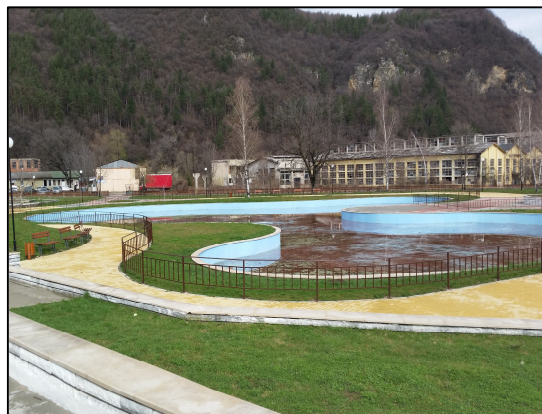
Reconstructed Park “The Lake” in the municipality of Etropole