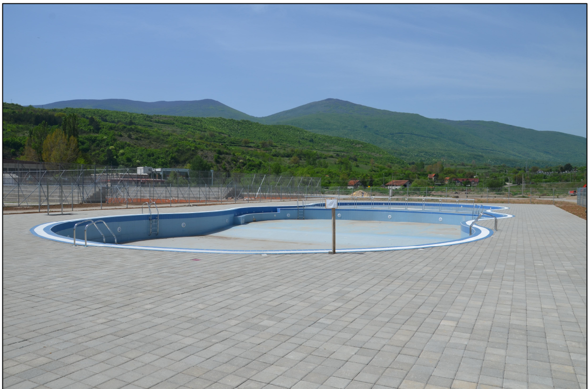
Reconstructed Park "Banjica" in the municipality of Bela Palanka