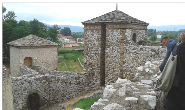
Alternative tourism in the cross-border region: active tourism, historical and nature sites