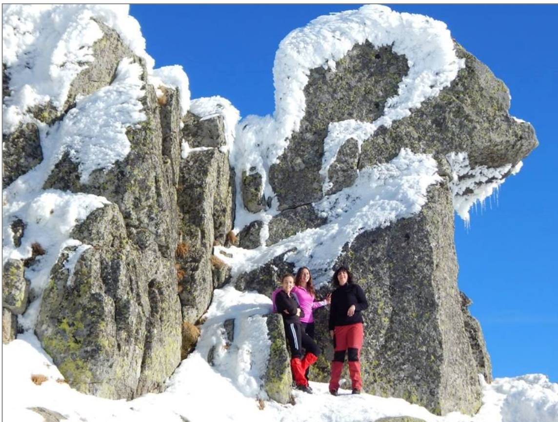
Stara Planina Mountain